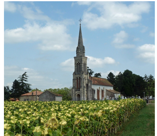
Lompian, place where the “Little Society” used to meet.

living in the country, it was by correspondence that I directed that Society; some of my young friends lived a hundred miles away. It is this Little Society that was the cradle of the Institute, for our first candidates were all formed in it. (438.3)